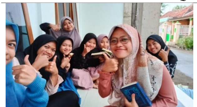
Picture 1. The activities of the male and female students in memorizing the Qur'an at Pesantren Hubbul Qur'an Yassalam Jombang

"We begin the learning process by introducing the basic rules of tajwid using the Tuhfatul Athfal book. The students are then taught to recite Qur'anic verses according to these rules, and we conduct daily evaluations to ensure they understand the material" (Interview, November 15, 2024).